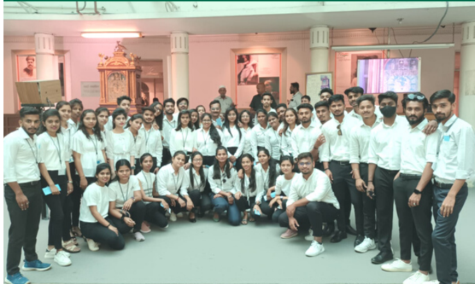
3 rd Sem Students visited Parle Manufacturing unit and historical places like Golkonda fort, Salar Jung Museum and Ramoji film city, Hyderabad from 5 th to 10 th Jan 2023.